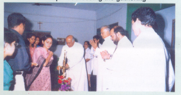
Inauguration of Internship 2004-05 Batch