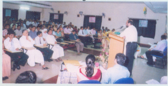
Principal addressing the gathering