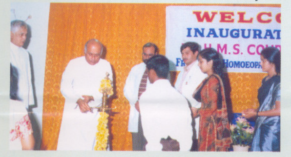
Inauguration of New batch of students - 2004-05 Batch